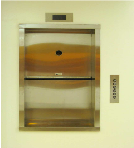
Figure 4 - Elevchem (dumbwaiter)