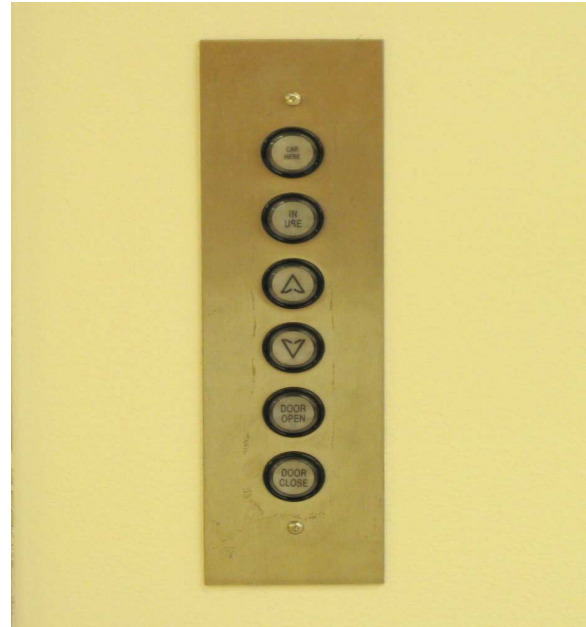
Figure 5 - Elevchem (dumbwaiter) Buttons