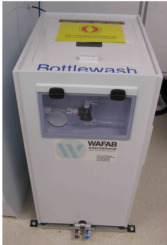
Figure 1 - Bottle Wash

16STNBYA for tystar16). Report on the WAND in the comments section for each furnace that clean dummies have been installed in the furnaces.