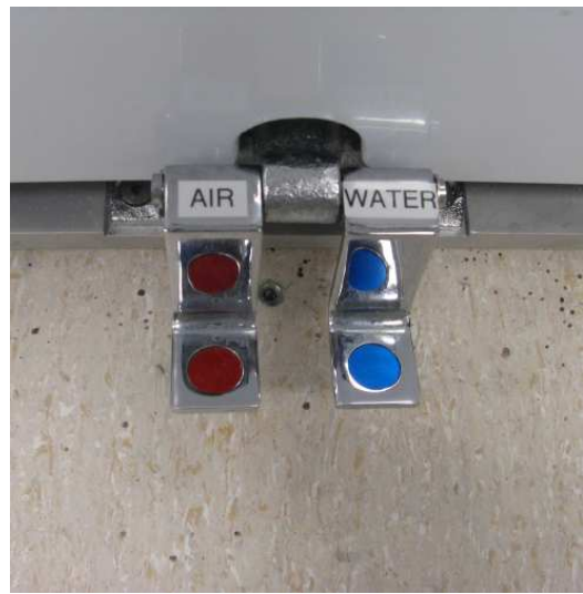
Figure 3 - Bottle Wash foot pedals